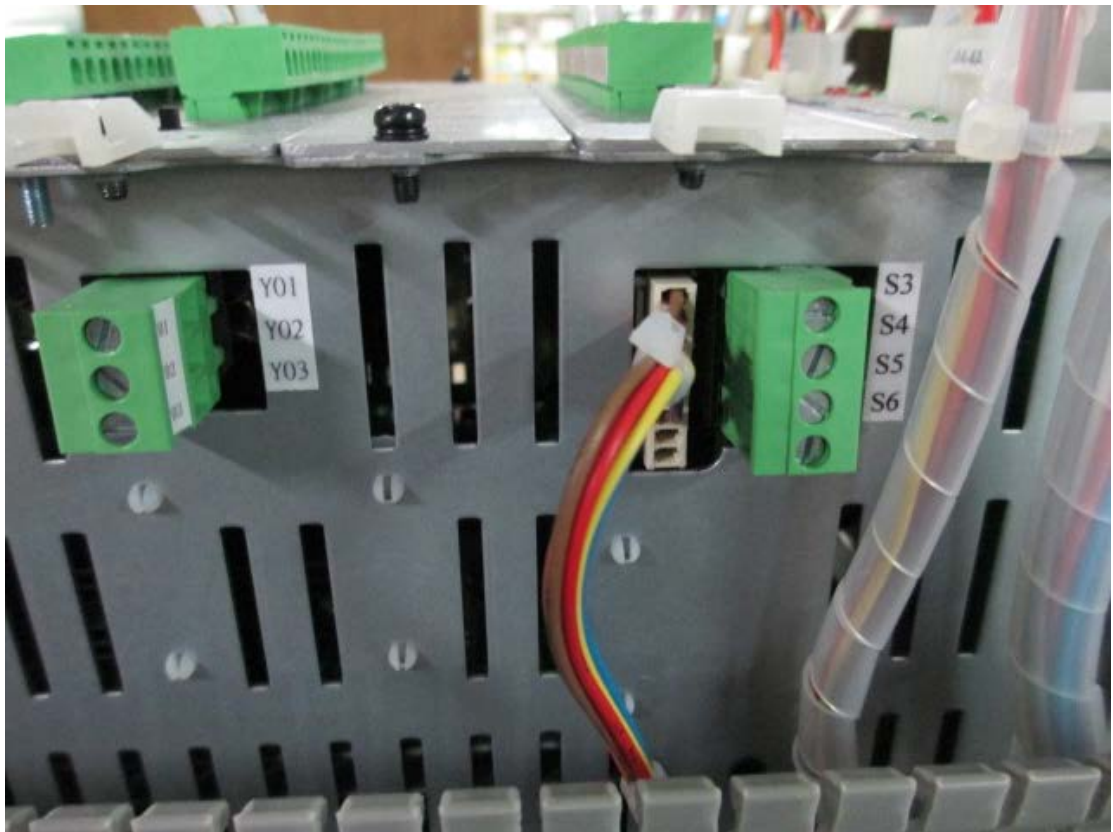
(圖二) (Fig. 2)