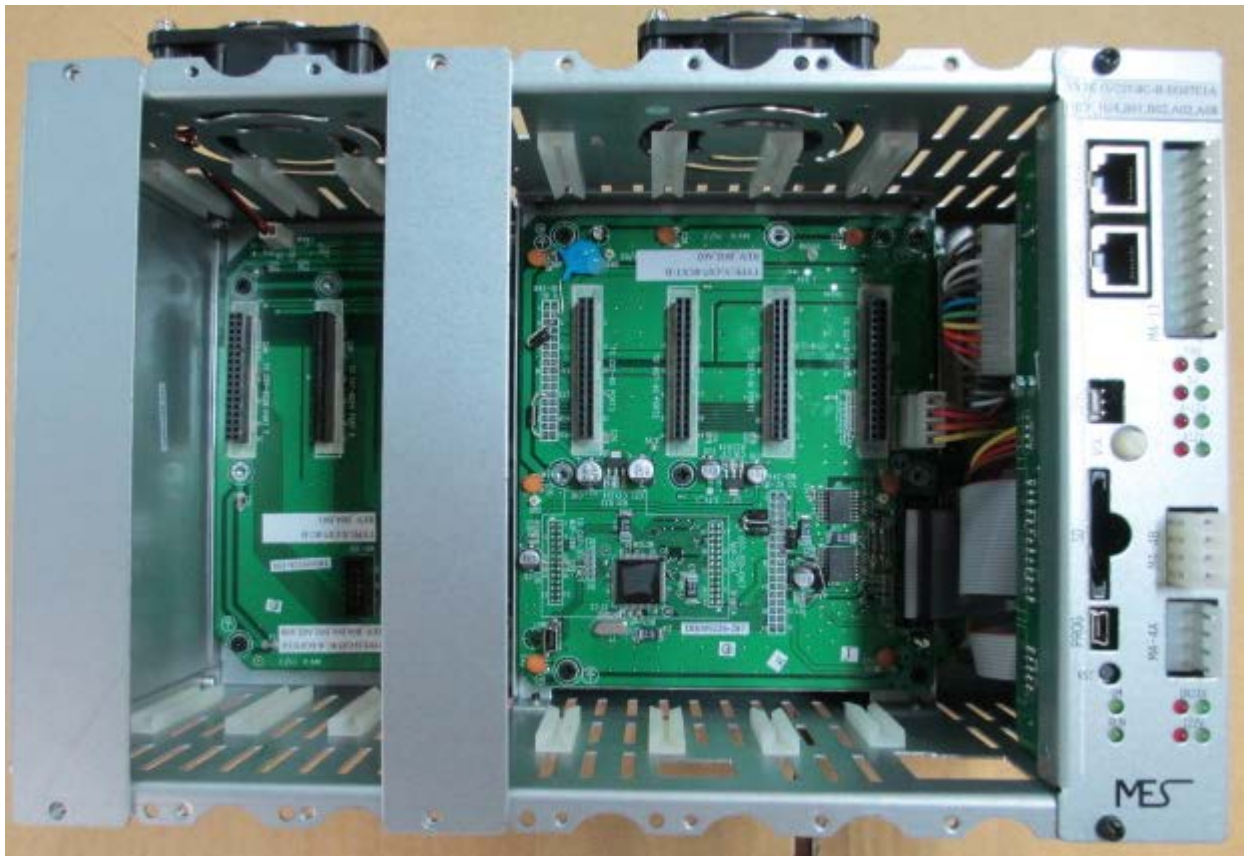
(圖五) (Fig. 5)